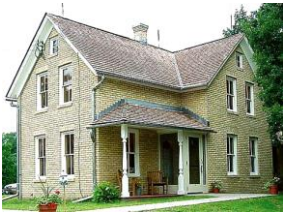
700 County Rd. 1